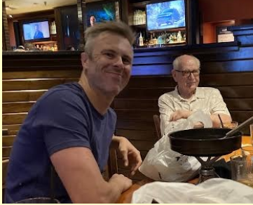
A few photos from our Social Dinner at BJ's Was a wonderful evening Good food and conversation